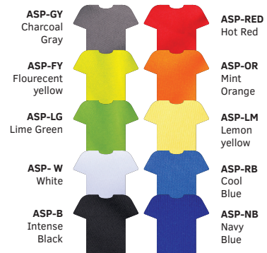
ASP-RED Hot Red