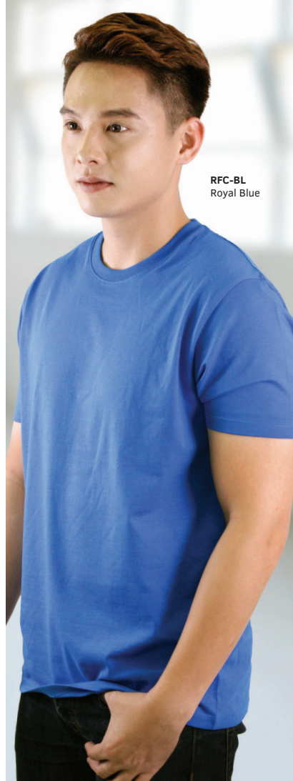
RFC-BL Royal Blue